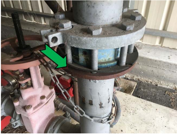
Photo 1. Interior, fire suppression pump system, gasket – non asbestos-containing gasket material.